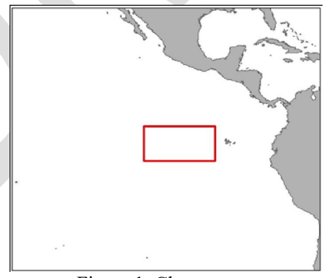
Figure 1. Closure area