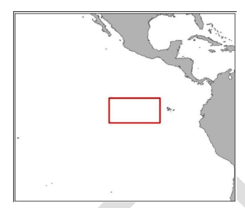
Figure 1. Closure area

4. The fishery for yellowfin, bigeye, and skipjack tuna by purse-seine vessels within the area of 96° and 110°W and between 4°N and 3°S, known as the "corralito", which is illustrated in Figure 1, shall be closed from 00:00 hours on 9 October to 24:00 hours on 8 November of each year.